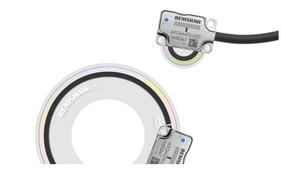
ATOM encoder readhead with RCDM disc scales

In all, ATOM helps to streamline the REVO-2 manufacturing process, while still providing exceptional metrology performance.