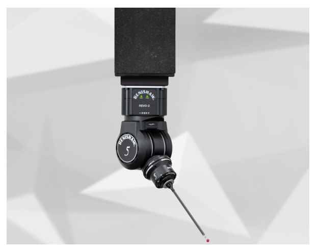
REVO-2 measuring head

ATOM systems provide two different methods for disc alignment, one electrical the other optical, and REVO-2's dual readhead set-up allows either type to be used. In this case, optical alignment was chosen to give a simple and highly repeatable way of setting disc runout – to help minimise process variability. This technique uses a microscope, connected to a camera, to monitor the movement of the alignment band as the disc is rotated. The disc is adjusted until the total alignment band movement is to within design specifications. It had previously taken up to an hour or more to complete this operation and align and lock the custom readhead in place. Now, ATOM is designed to allow readhead / scale mounting and alignment within a couple of minutes.