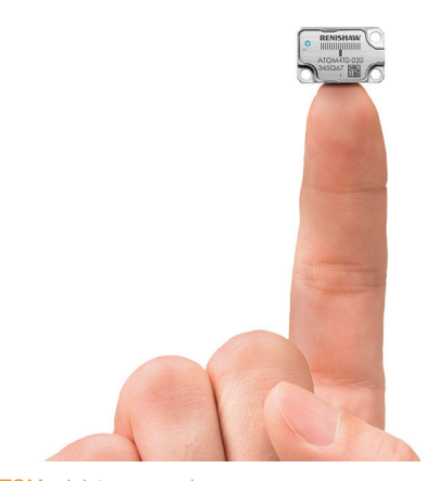
ATOM miniature encoder

ATOM is designed to support manufacturing and servicing operations with unrivalled technical support, streamlined installation and robust calibration procedures. The end result is reduced process cycle times, higher unit yields, greater efficiency and lower production costs. REVO and ATOM are leading products that are now combined in the powerful REVO-2.