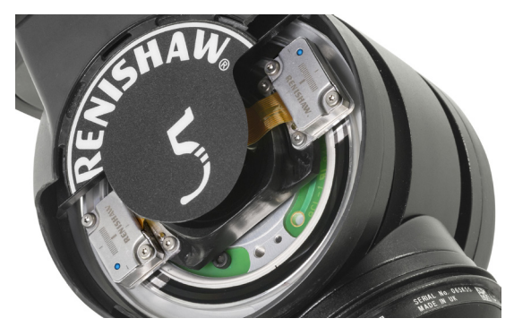
ATOM encoders on REVO-2 measuring head

The ATOM readheads are connected, via an analogue filter and analogue-to-digital converter (ADC), to REVO-2's electronics. ATOM, with its advanced highly-automated manufacturing processes that minimise process variability to assure the best quality and the shortest lead times, was chosen by REVO-2's design team as the most cost effective solution.