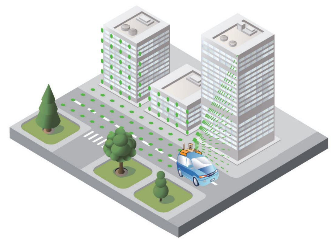
Figure 1: LiDAR scanning in action

Renishaw's ATOM™, ATOM DX™, QUANTiC™ and TONiC™ incremental encoder product ranges are helping LiDAR manufacturers to achieve their design objectives.